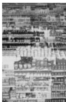
Wal-Mart, Supermarket, Monroe, New York, USA

This edition was released on 18 March 2008.