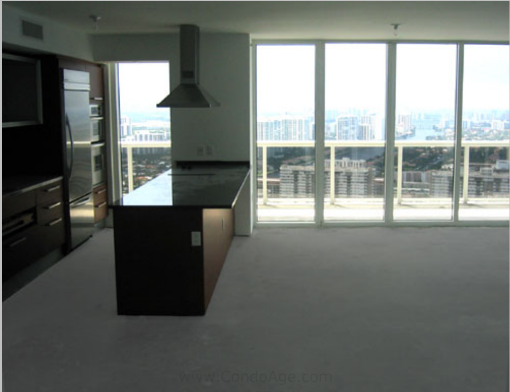
Your Kitchen blends into the dining area, which, in turn, flows into the Great Room.