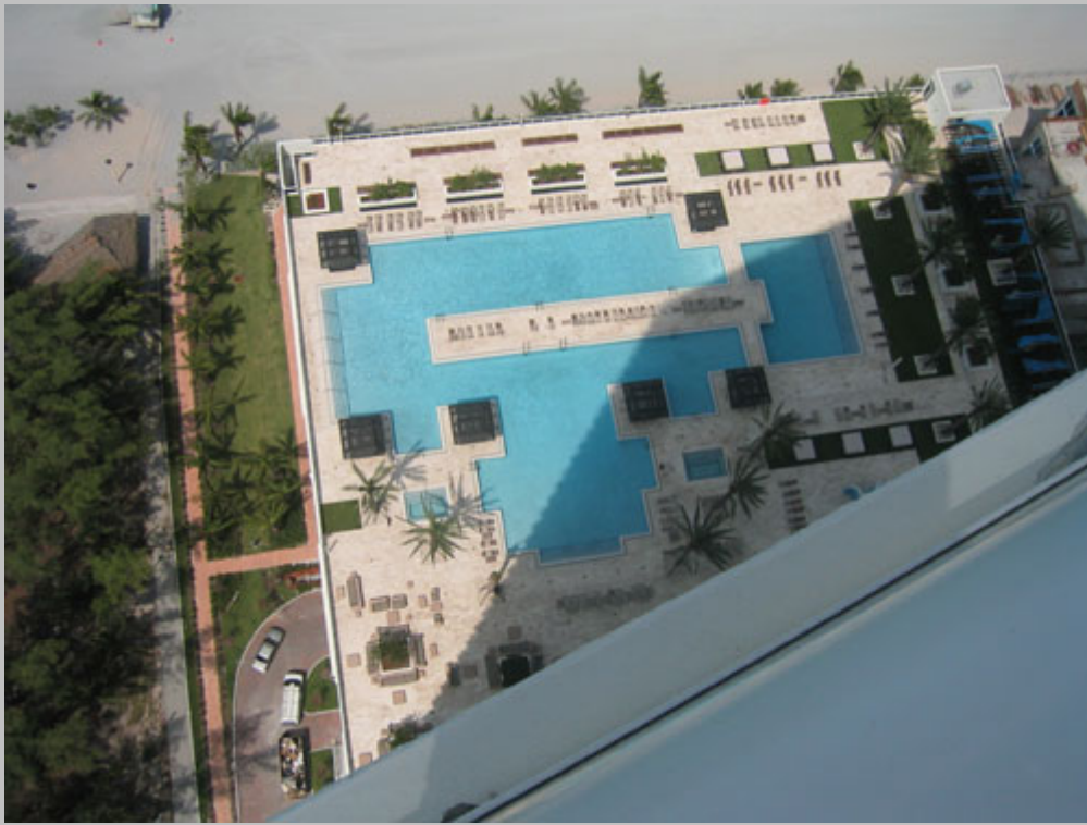
As you look down, you can see the stunning pool area below, which leads onto the beach.