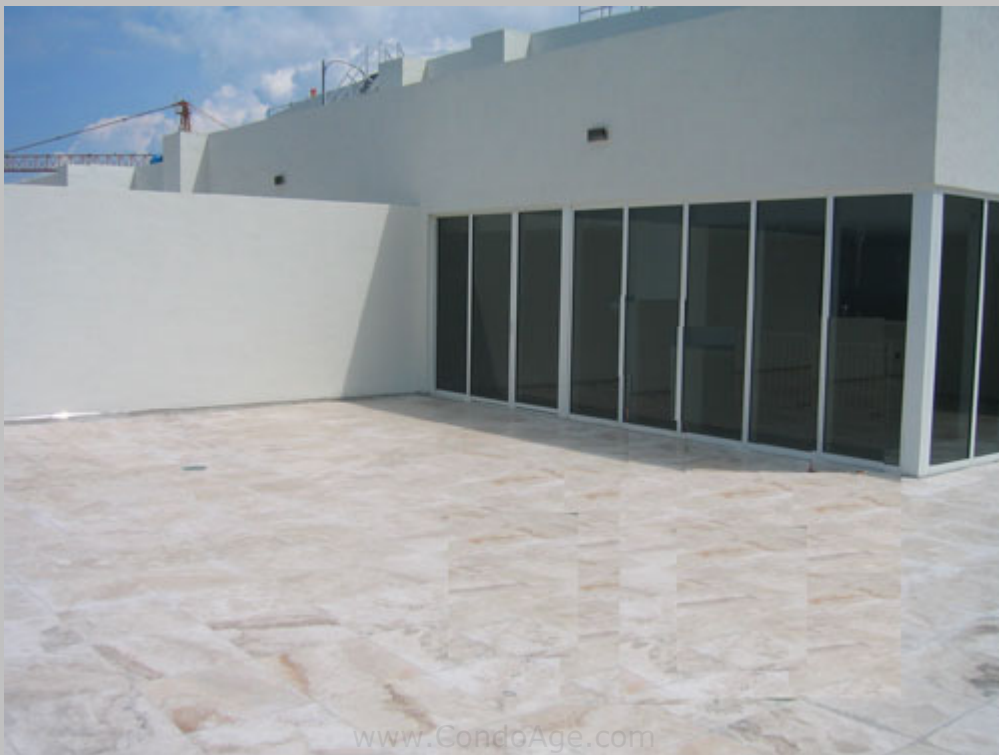
www.CondoAge.com The terrace is private, and for your use only.