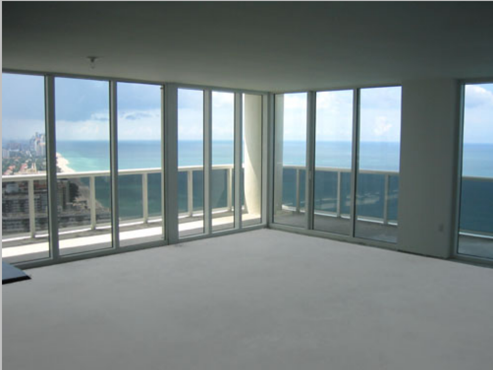
The Great Room is the center of all activity. It has sweeping corner views of the ocean, beach and everything else around Hallandale. This is a North-East view.