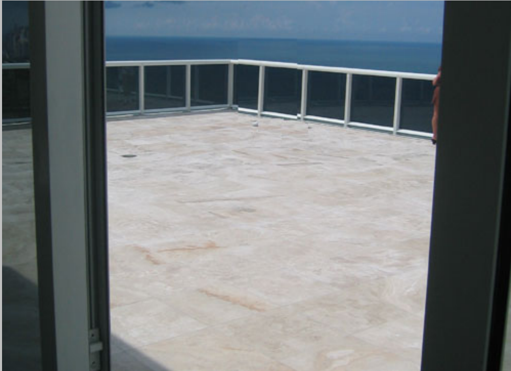
The upper level opens up to one of the largest private outdoor terraces we have seen. This measures 1928 sf (179.1 m 2 ).