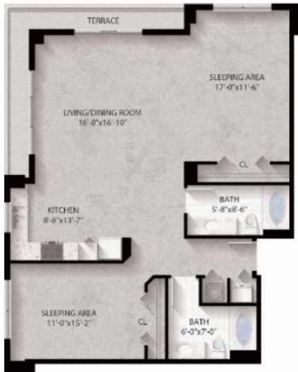
Unit B3 2 Bedroom, 2 Bath Under A/C 1153 sq. ft. 107.12m2