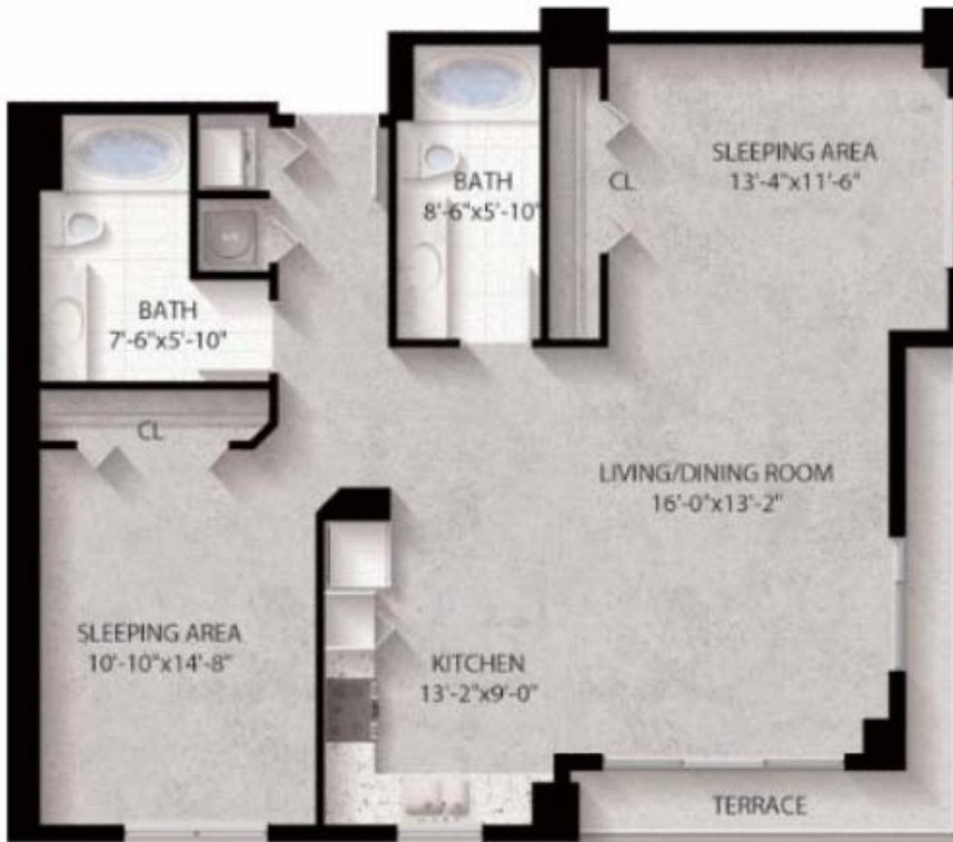
Unit B2 2 Bedroom, 2 Bath Under A/C 1041 sq. ft. 96.71m2