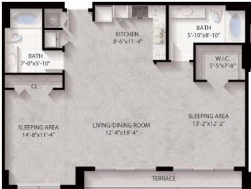
Unit B1 2 Bedroom, 2 Bath Under A/C 1010 sq. ft. 93.83m 2