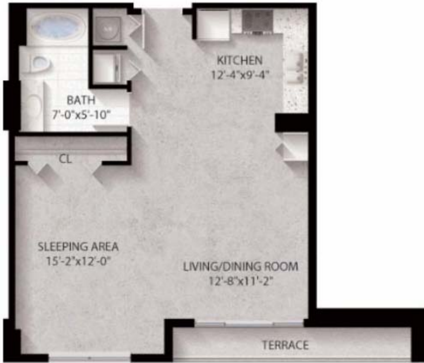
Unit A4 1 Bedroom, 1 Bath Under A/C 665 sq. ft. 61.78m 2